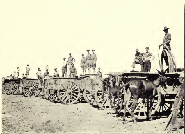
THE SUPPLY WAGONS